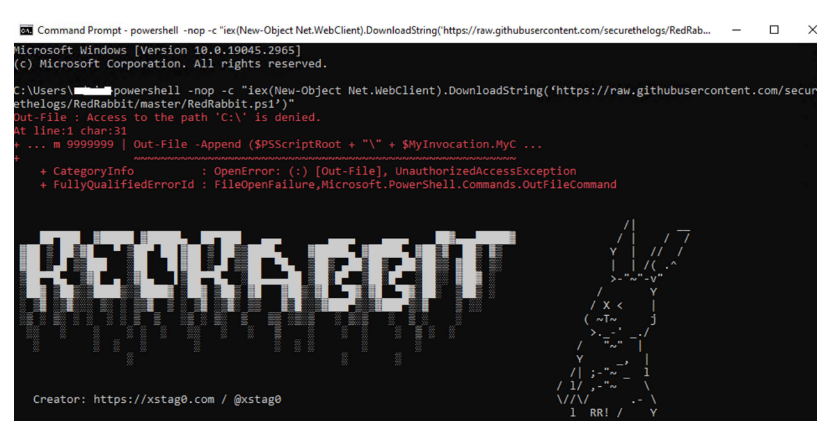
Fig. 2.5.2, Exploiting Threatwise lab instance by loading ethical hacking tool RedRabbit directly in memory of PowerShell.