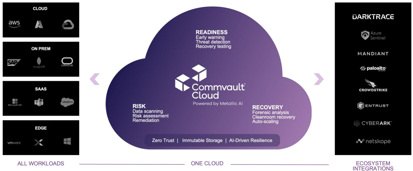
Figure 2. Commvault Cloud: Secure and Recover Data Wherever It Lives—With the Simplicity, Speed, and Scale of Cloud