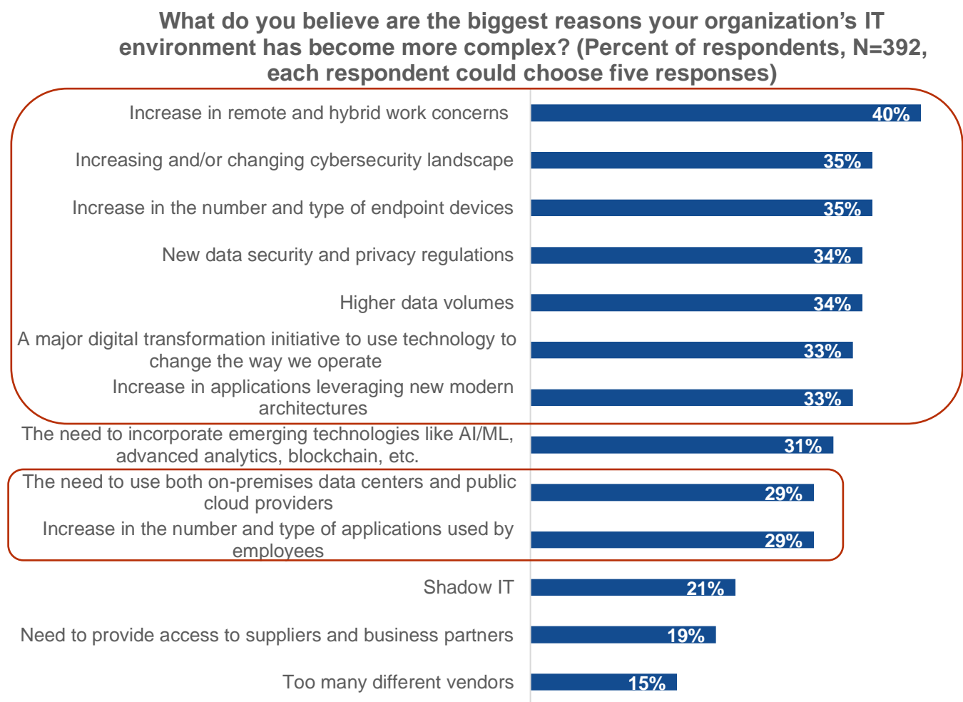
Figure 1. 9 of the 13 Top Reasons for Increasing IT Complexity Directly Map to New Cyber Resiliency Challenges